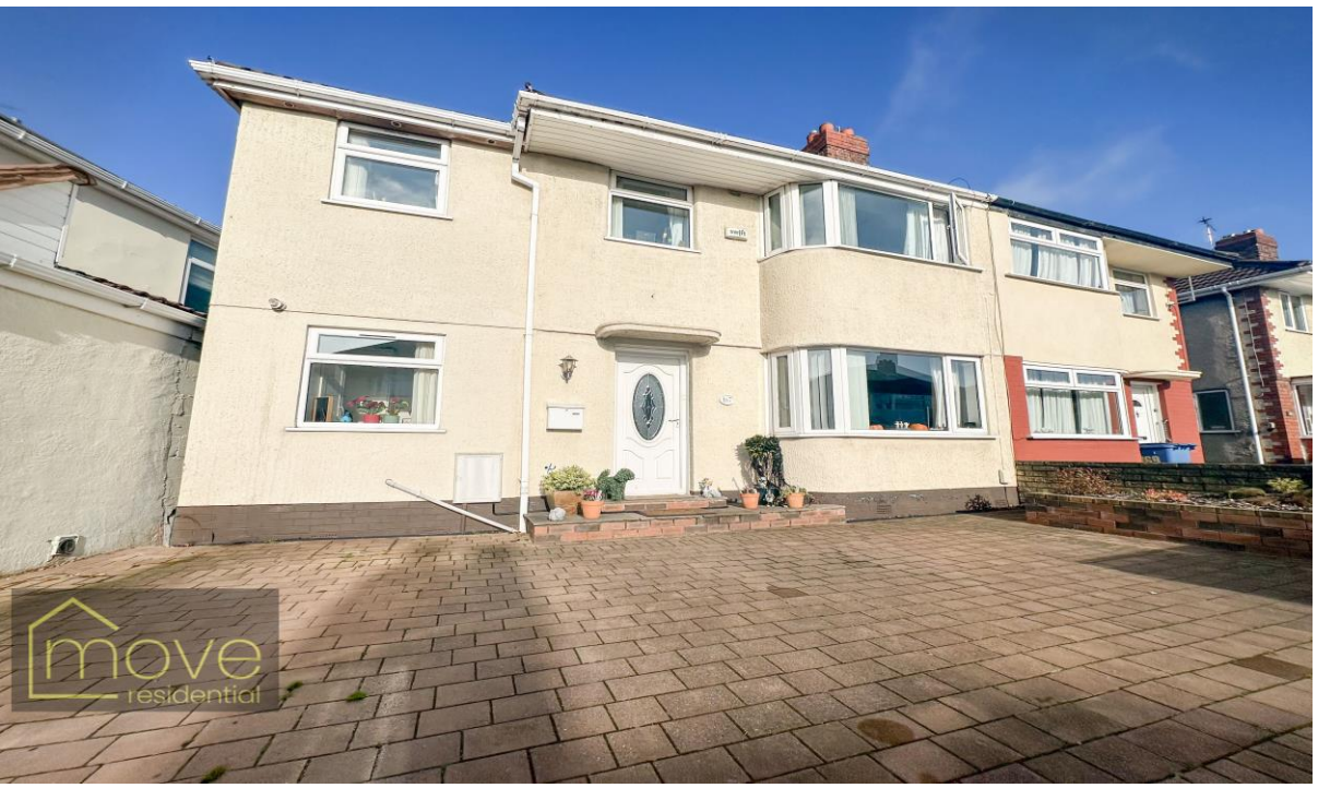
Pitville Avenue, Mossley Hill, Liverpool, L18 7JH