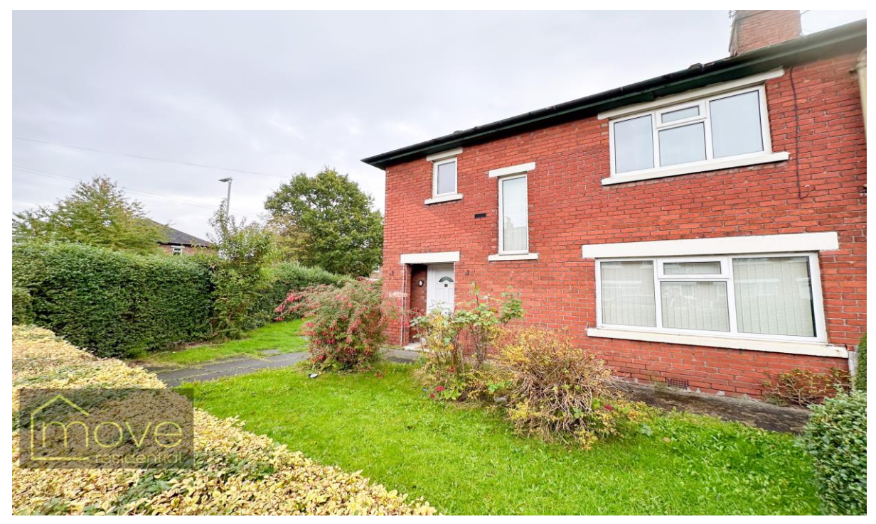
Attlee Road, Huyton, Liverpool, L36 6BQ