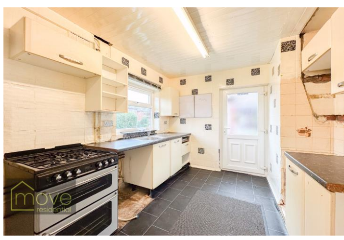
Offers in Excess of £150,000