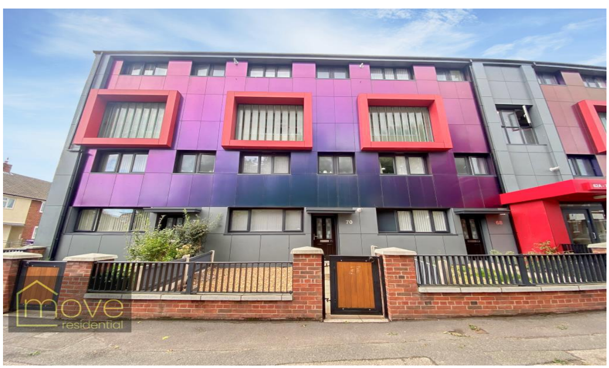
Wellington Road, Wavertree, Liverpool, L15 4JN