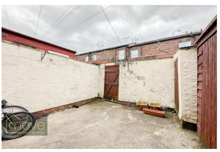
Offers in Excess of £110,000