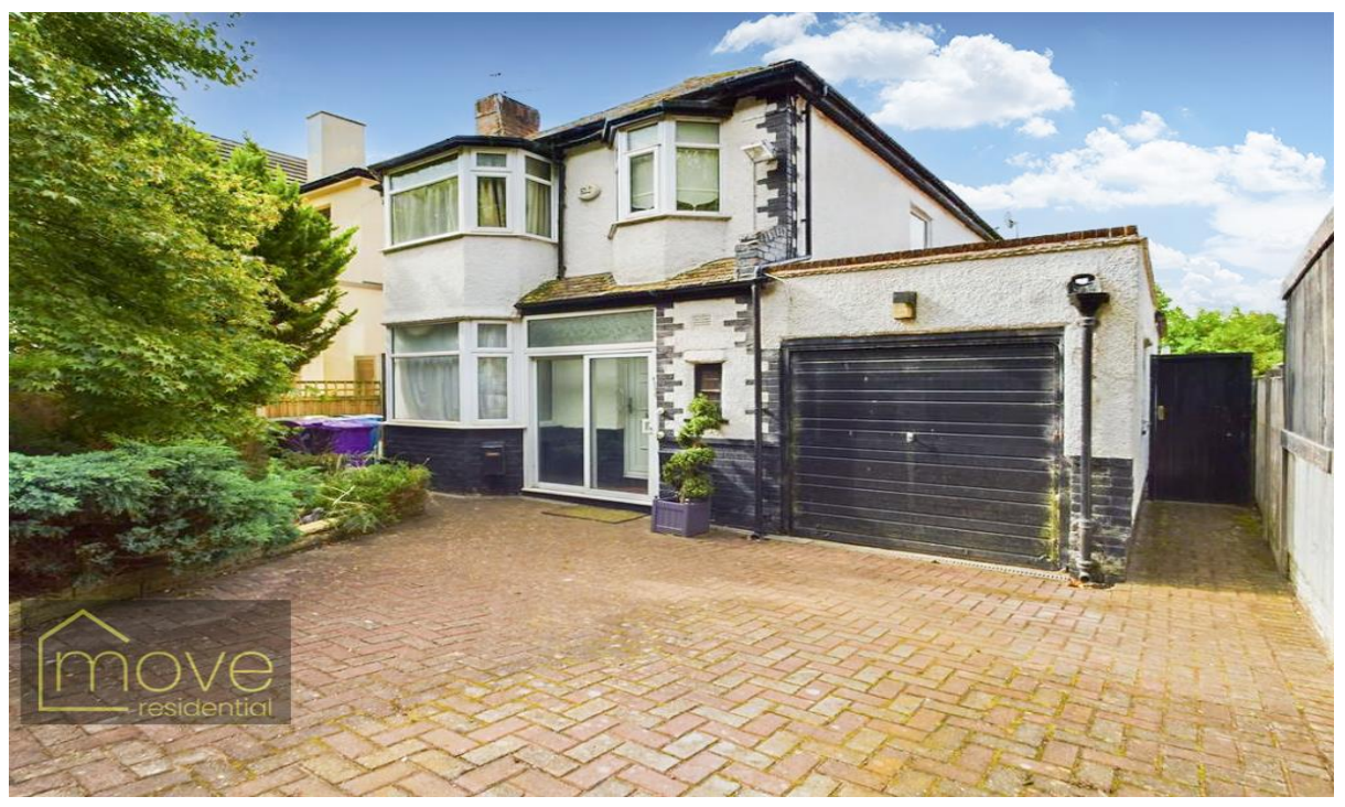
Allerton Road, Calderstones, Liverpool, L18 9UU