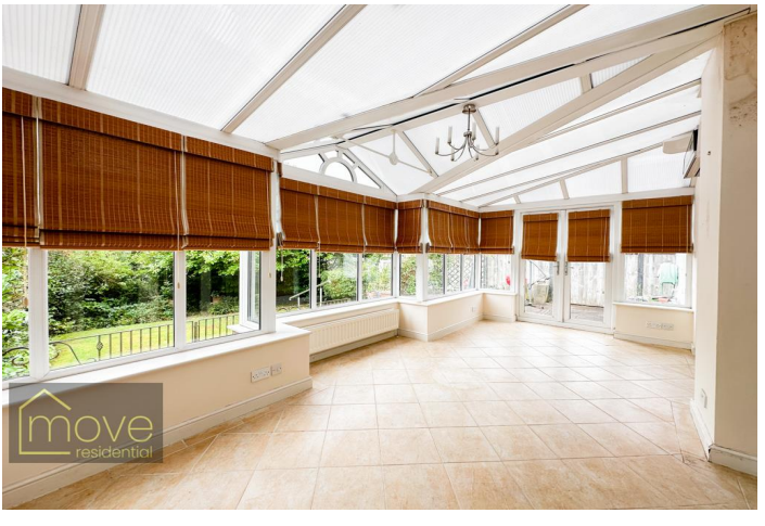
Offers in Excess of £500,000