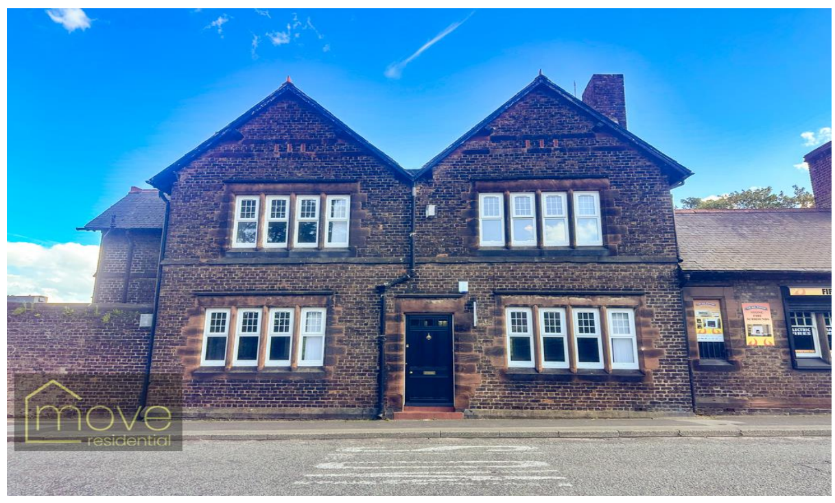
Station House, West Derby, Liverpool, L12 7JA