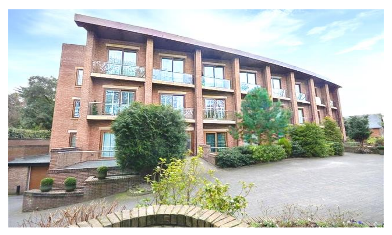
Yew Tree House, Calderstones, Liverpool, L18 3JN