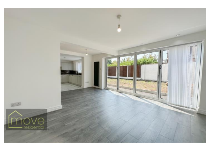
Guide Price £425,000