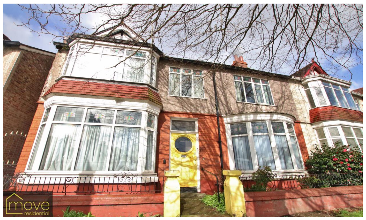
Menlove Avenue, Mossley Hill, Liverpool, L18 1LS