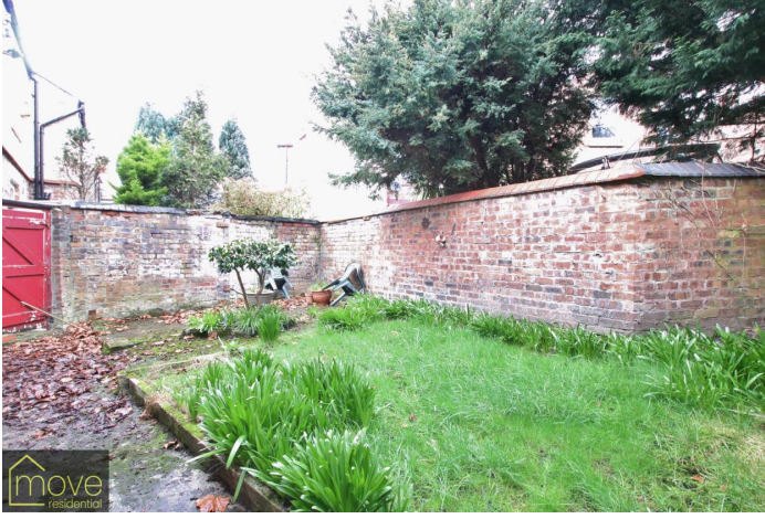
Offers in Excess of £325,000