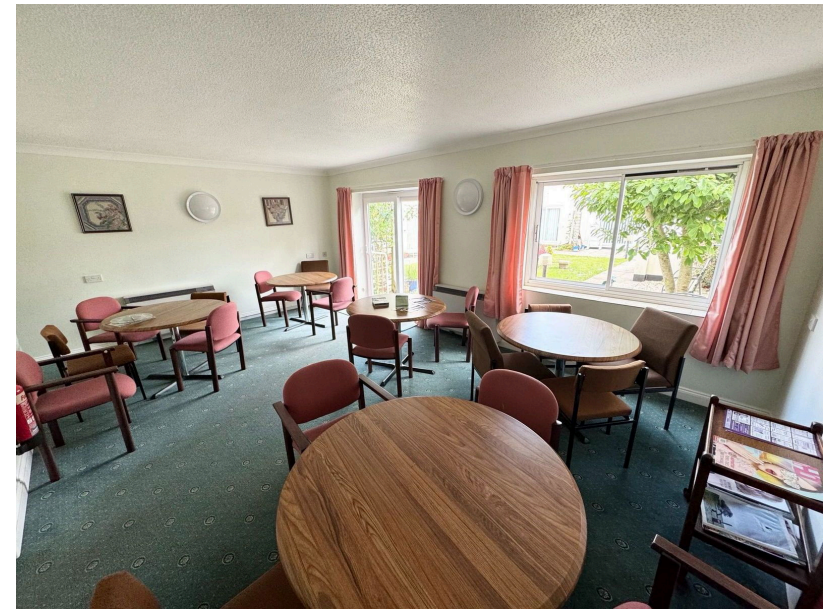
Apartment 6 Dawes Court

Accommodation briefly comprises; Entrance, Hallway, Good sized Living Room, Kitchen, Double Bedroom with fitted wardrobe and Bathroom. Double glazing and electric heating. Outside there is communal parking, residents lounge, laundry room and well kept communal gardens. The Town Centre, Shops, Doctors and Bus Services all close by. Vacant Possession just call us to View !!