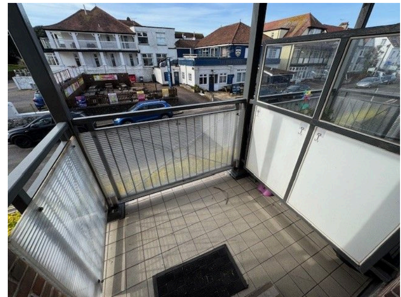
42 Tembani Court

A First Floor Retirement Apartment ideally located on Preston Seafront and Green. The property comprises a spacious lounge with balcony off, kitchen, 2 bedrooms, shower room, hallway and a separate cloakroom. Development benefits include on-site laundry room, a communal residents lounge and a part time on-site house manager. The flat is situated approximately a quarter of a mile from Preston & Paignton centres, local shops and amenities. Just a level stroll away you can find Preston Sands Beach and a local bus top.