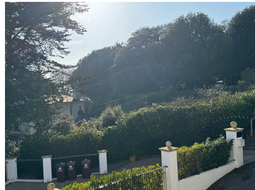
18 MANORGLADE COURT

A compact, converted Flat enjoying SEA VIEWS situated in the sought after Warberries area. Ideal for a first time buyer, investment or for someone just looking to downsize. Accommodation briefly comprises; Communal Entrance, open plan Lounge Bedroom with High Ceilings and a Kitchen, Bedrooms and Bathroom. Electric Heating and Double Glazing throughout. NO ONWARDS CHAIN !