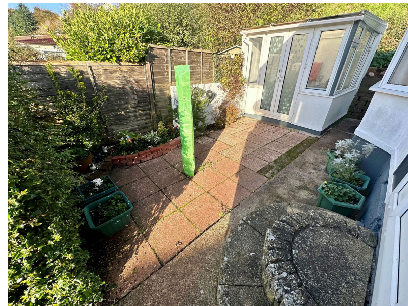
3 HILLSIDE PARK

CHAIN FREE!! An opportunity to acquire a well presented DETACHED PARK HOME for the Over 50's, situated in a quiet location enjoying some views towards the Countryside situated on the outskirts of Paignton at Hillside Park. The home offers 2 Bedrooms, airy Living Room, Kitchen Room, Inner Hall and Bathroom. LPG Gas Central Heating and UPVC Double Glazing. Outside there is a Summerhouse and level easy maintenance Gardens and Parking area close by. Further benefits include LPG Gas Central Heating and UPVC Double Glazing. Hillside Park can be found at the very bottom of Falcon Park on the Totnes Road. Ideal for someone looking to downsize to a peaceful location.