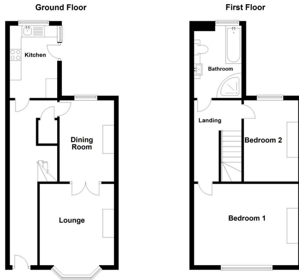
This plan is to be used only as an indication of the floor layout and is not to scale. Plan produced using PlanUp.