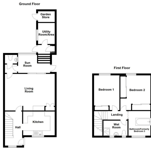
This plan is to be used only as an indication of the floor layout and is not to scale. Plan produced using PlanUp.