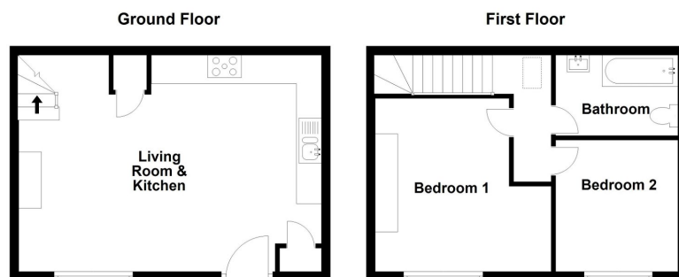
This plan is to be used only as an indication of the floor layout and is not to scale. Plan produced using PlanUp.