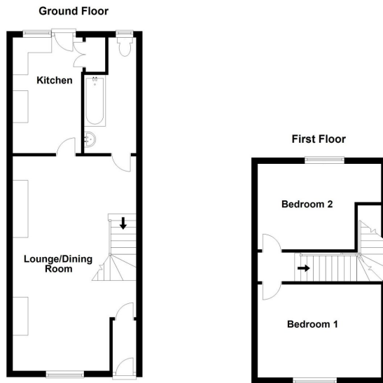
This plan is to be used only as an indication of the floor layout and is not to scale. Plan produced using PlanUp.