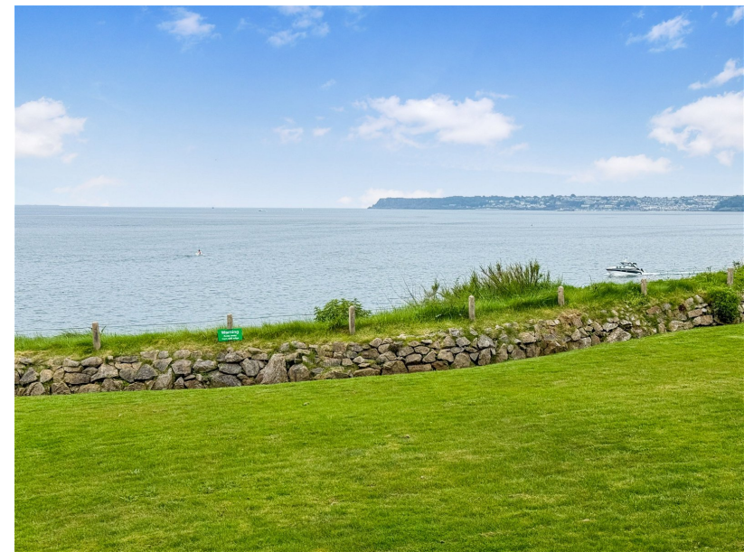
G/F APARTMENT 1 CLIFF HOUSE

Good Sized CHAIN-FREE 2 bedroom ground floor apartment in the desirable area of Roundham with arguably the best PANORAMIC SEA VIEWS stretching across Torbay from Thatcher's Rock to Berry Head. In need of updating throughout. Accommodation comprises spacious Living room, Kitchen, 2 double Bedrooms, Hallway and Shower room. Outside are well very maintained communal Gardens, a single Garage and Residents Parking. The Development is in level walking distance to Town and the Historic Harbourside.