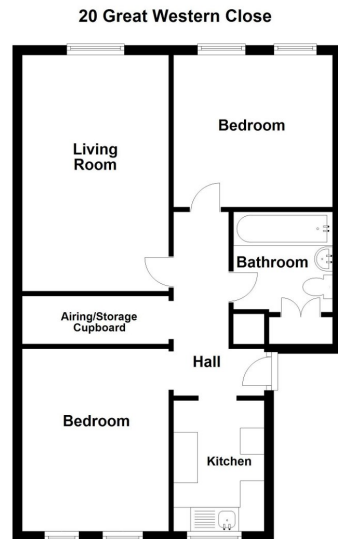
This plan is to be used only as an indication of the floor layout and is not to scale. Plan produced using PlanUp.