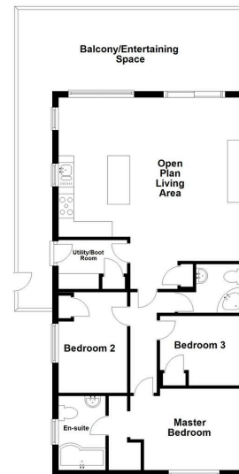
This plan is to be used only as an indication of the floor layout and is not to scale. Plan produced using PlanIt.

If you are looking for a Holiday Lodge on a well regarded Holiday Park with excellent facilities and close to the picturesque, traditional seaside town of Brixham, then Landscope Holiday park is perfect for you ! This high quality Lodge has 3 Bedrooms (1 En-Suite) large Open plan Living space (with sofa bed) with high quality Fitted Kitchen and Family Shower Room. Large Deck and Parking. Central heating and double glazing. It offers coastal views and great seaside walks along the nearby Devon coastal footpath with countless sightseeing and leisure opportunities. There are outdoor and indoor swimming pools, a fantastic clubhouse/entertainment complex and a Shop. You even have the option of making a valuable extra income by subletting it when you aren't using it yourself its ready to vie wso come on down!