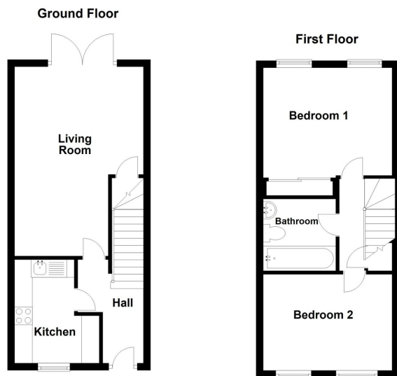
This plan is to be used only as an indication of the floor layout and is not to scale. Plan produced using PlanUp.