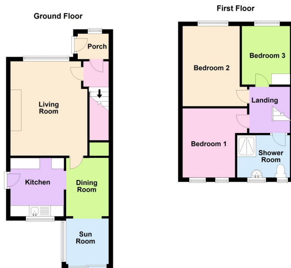
This plan is to be used only as an indication of the floor layout and is not to scale. Plan produced using PlanUp.