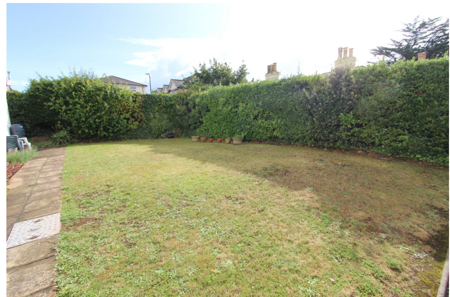
Apartment 5 Fernlea

Apartment 5 Fernlea is situated in a small development in a tucked away position on the outskirts of the town centre but very convenient for local shops and transport routes. This modern first floor apartment consists of a spacious double bedroom, 23ft lounge/dining room with kitchen area off, hallway and bathroom. The property is double glazed and gas centrally heated throughout. Outside there is allocated and visitors parking and well maintained communal gardens. Offered for sale with no onward chain.