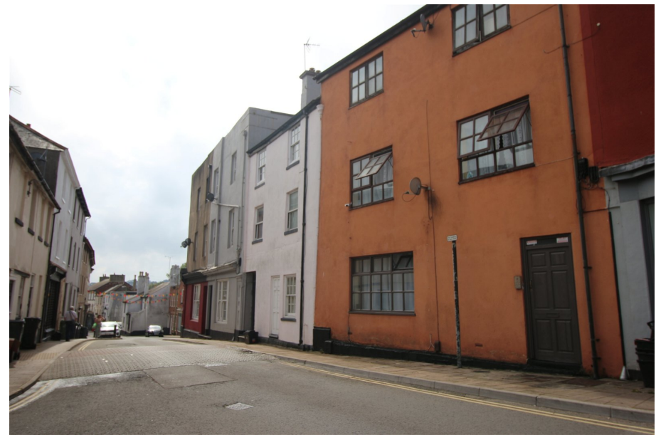
Flt 1, 157 Winner Street Paignton

A Well Presented Ground Floor Flat situated right in the heart of Paignton Town Centre. Ideal FTB or for Investment. Accommodation comprises Lounge , Fitted Kitchen, Bedroom, Hallway and Shower Room. Gas Central Heating and Double Glazing. Outside to the first floor there is a communal Patio Area. Great location for access to all of the Shops and Amenities of Paignton Town Centre.