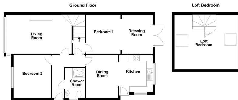
This plan is to be used only as an indication of the floor layout and is not to scale. Plan produced using PlanUp.