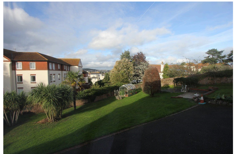
G/Floor Apartment Denby House