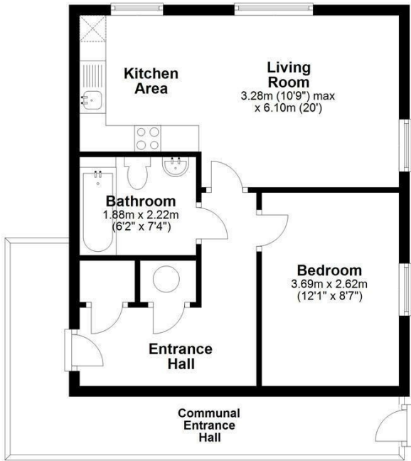
Total area: approx. 43.1 sq. metres (464.2 sq. feet) Flat 10, Brian Roberts House, Beach Street, Herne Bay