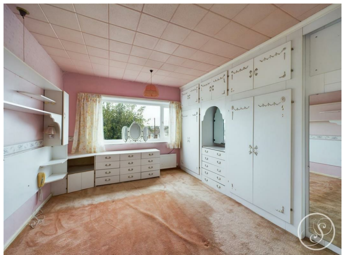
Bedroom One 13'6" x 10'11" (4.14 x 3.33)

Double glazed window to front. Central heating radiator. Fitted wardrobes.