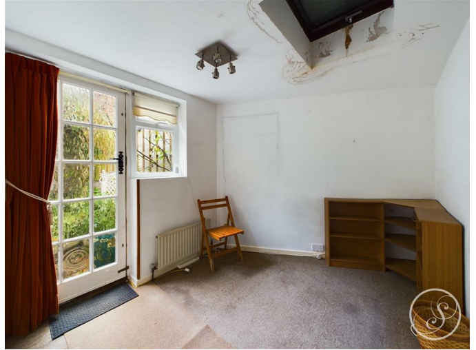
Sitting Area 10'4" x 8'0" (3.16 x 2.44)

Door and double glazed window to rear. Central heating radiator.