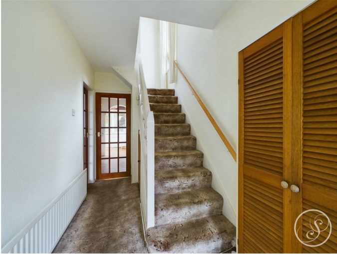
Entrance Hall 13'6" x 5'9" (4.12 x 1.76)

Door into porch. Staircase leading to first floor. Under stairs storage. Built in storage cupboard. Central heating radiator.