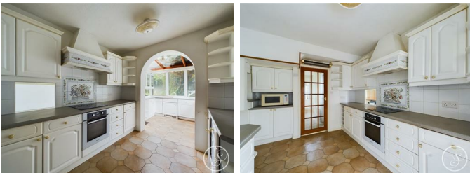
Kitchen 9'10" x 8'11" (3.01 x 2.72)

Fitted with a range of wall and base units with work surfaces over. Electric oven and halogen hob with extractor fan over.