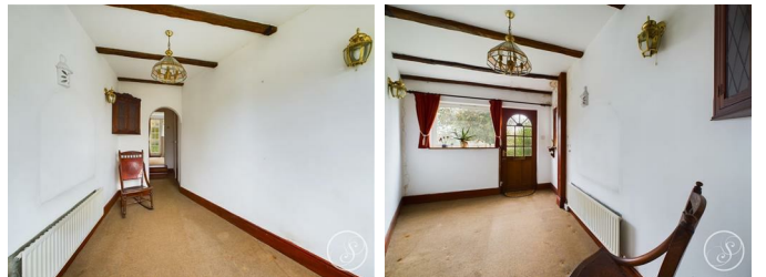
Office/Sitting Area 12'1" x 9'3" (3.69 x 2.84)

Central heating radiator. Door to front. Double glazed window.