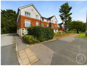
Communal gardens with residents on-site parking.