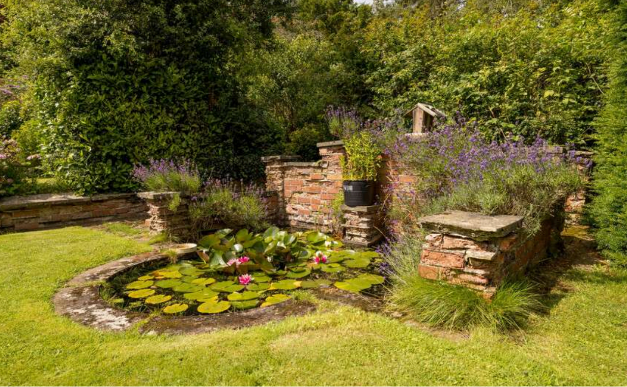
Property Image 17 - page 7