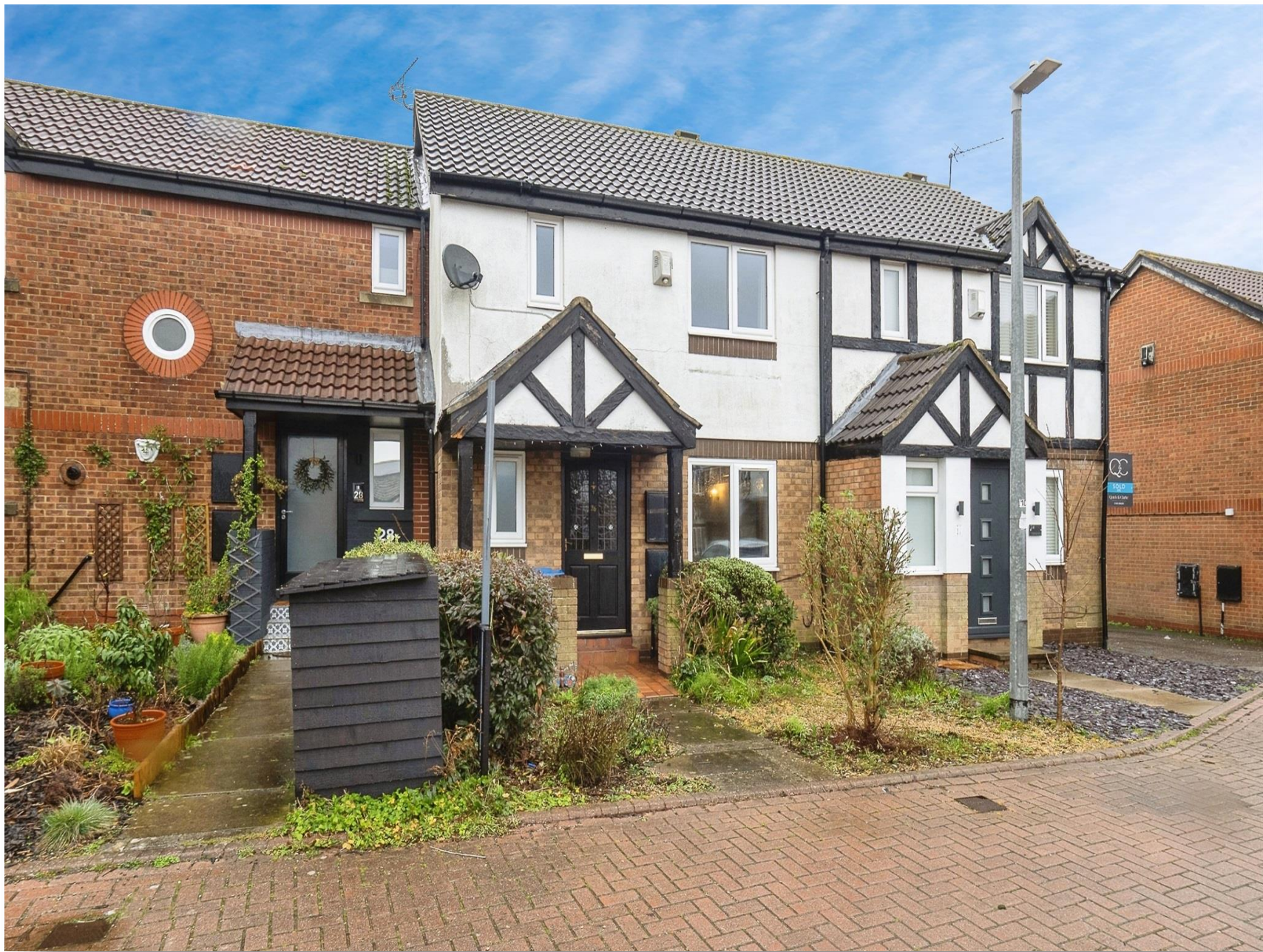
Colleridge Grove, Beverley, HU17 8XD