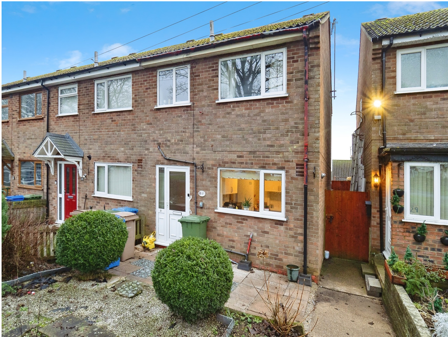
Easton Road, BRIDLINGTON YO16 4BE