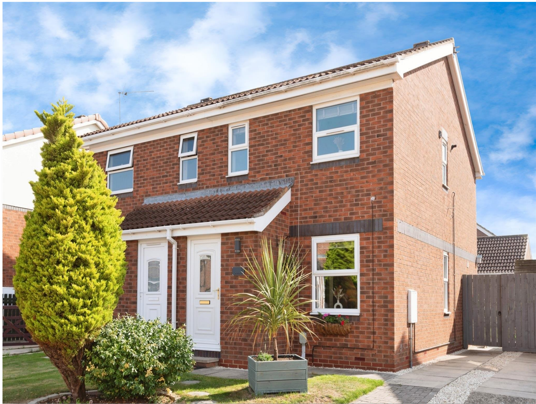
Rosemary Way, Beverley Parklands, Beverley, HU17 0SS