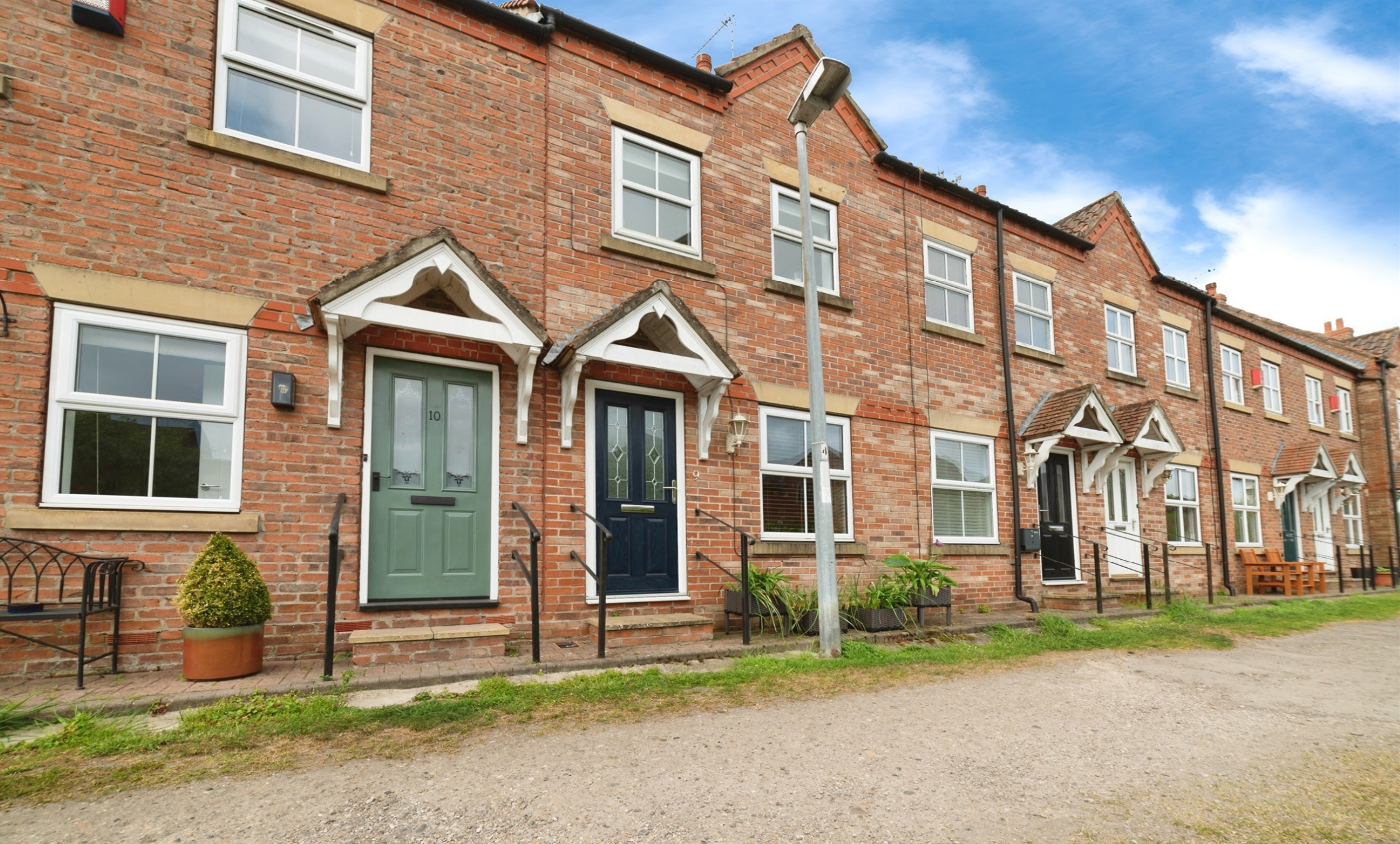
Marin Court, BEVERLEY HU17 0UH