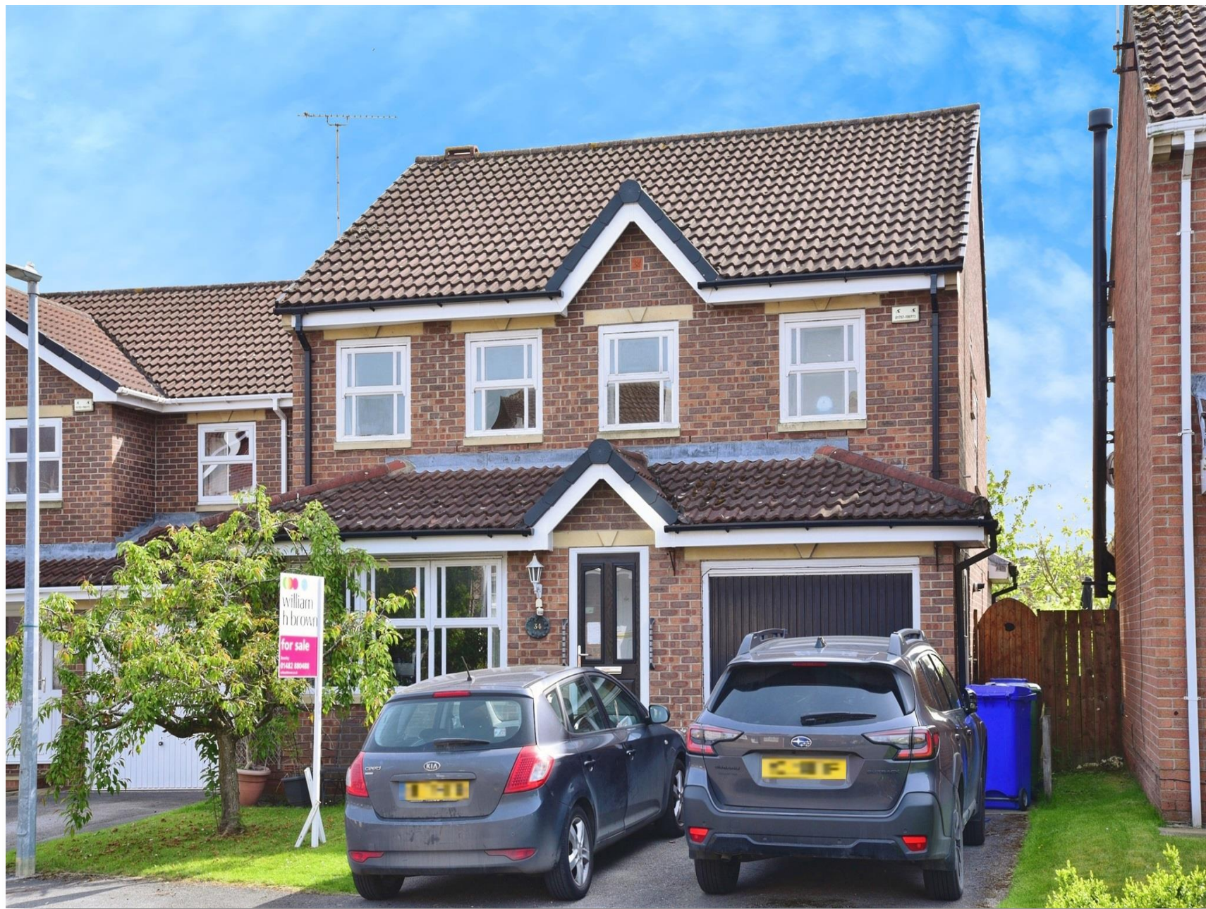
Sorrel Close, Beverley, HU17 8XL