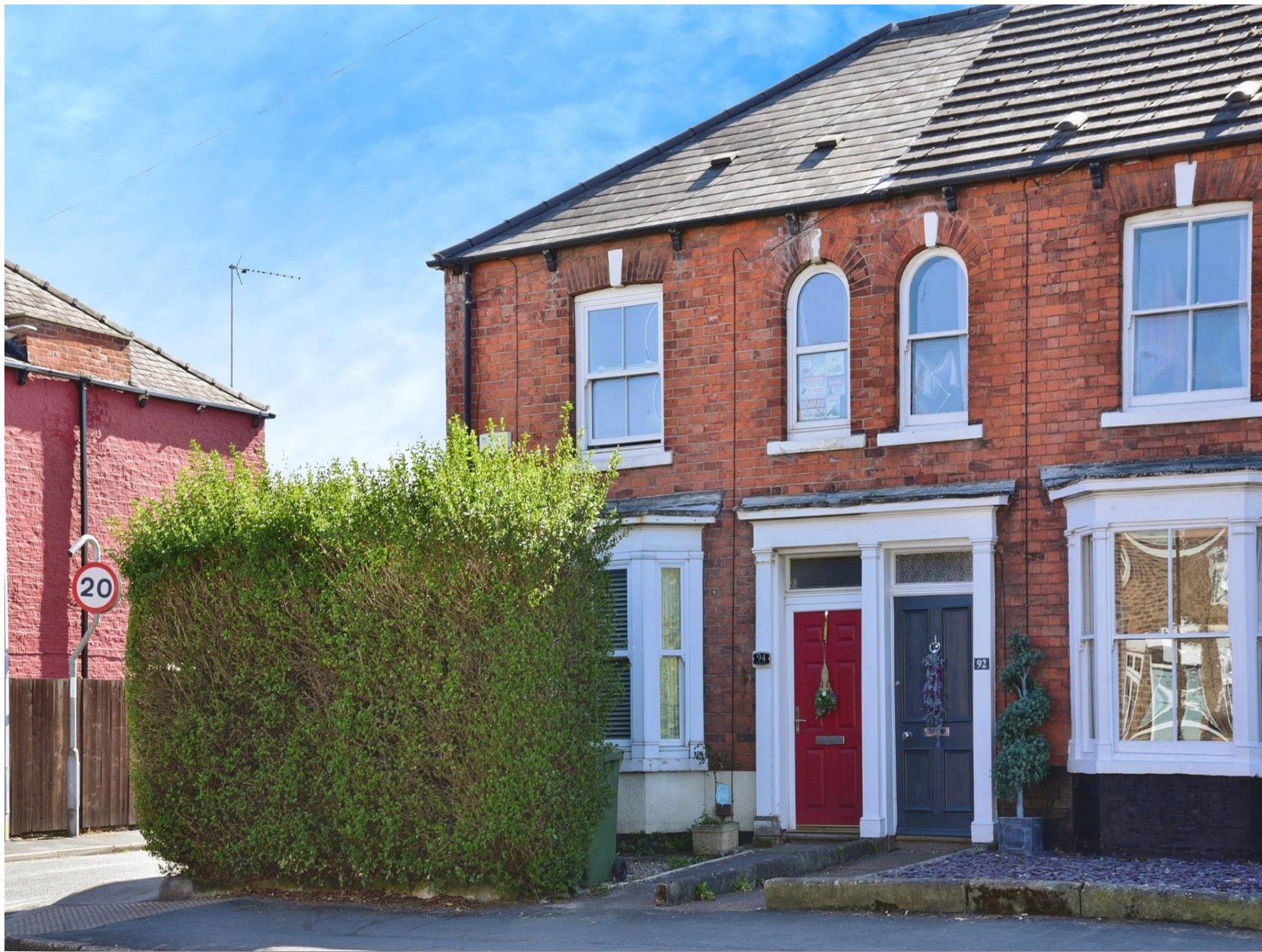
Norwood, BEVERLEY, HU17 9HJ