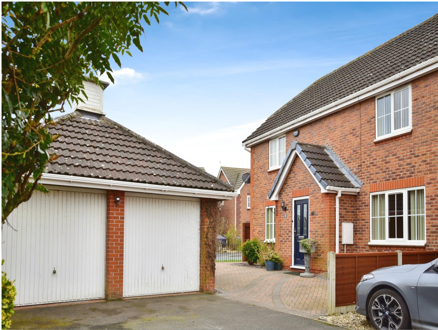
Ascott Close, Beverley, HU17 9TA