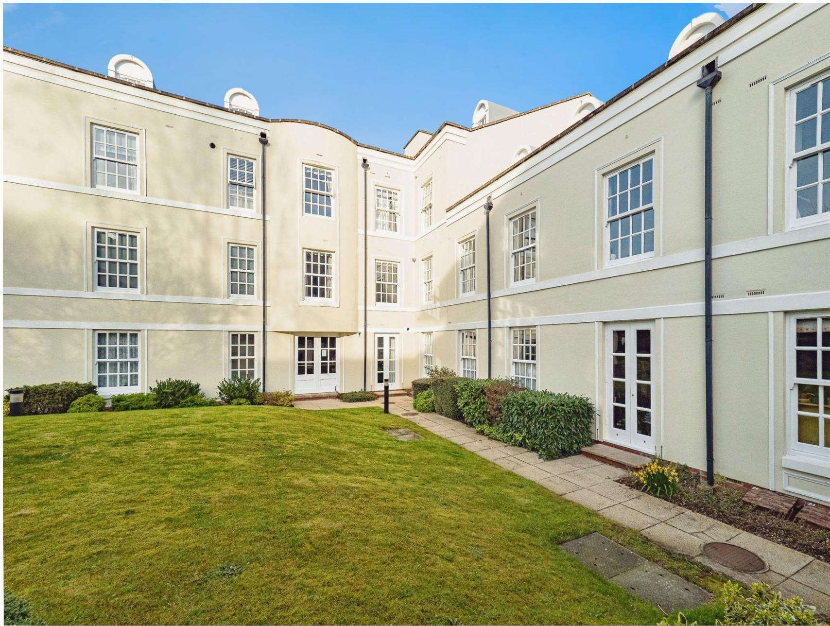
St Marys Manor, North Bar Within, BEVERLEY, HU17 8DE