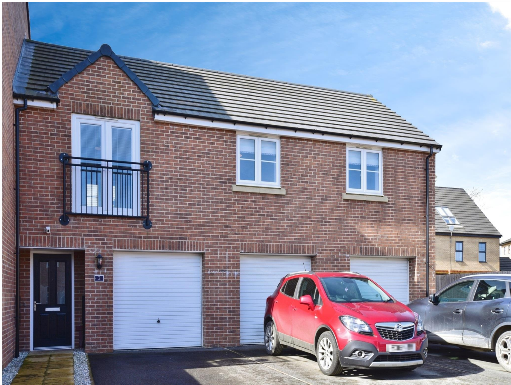
Copeland Garth, Beverley, HU17 0GS