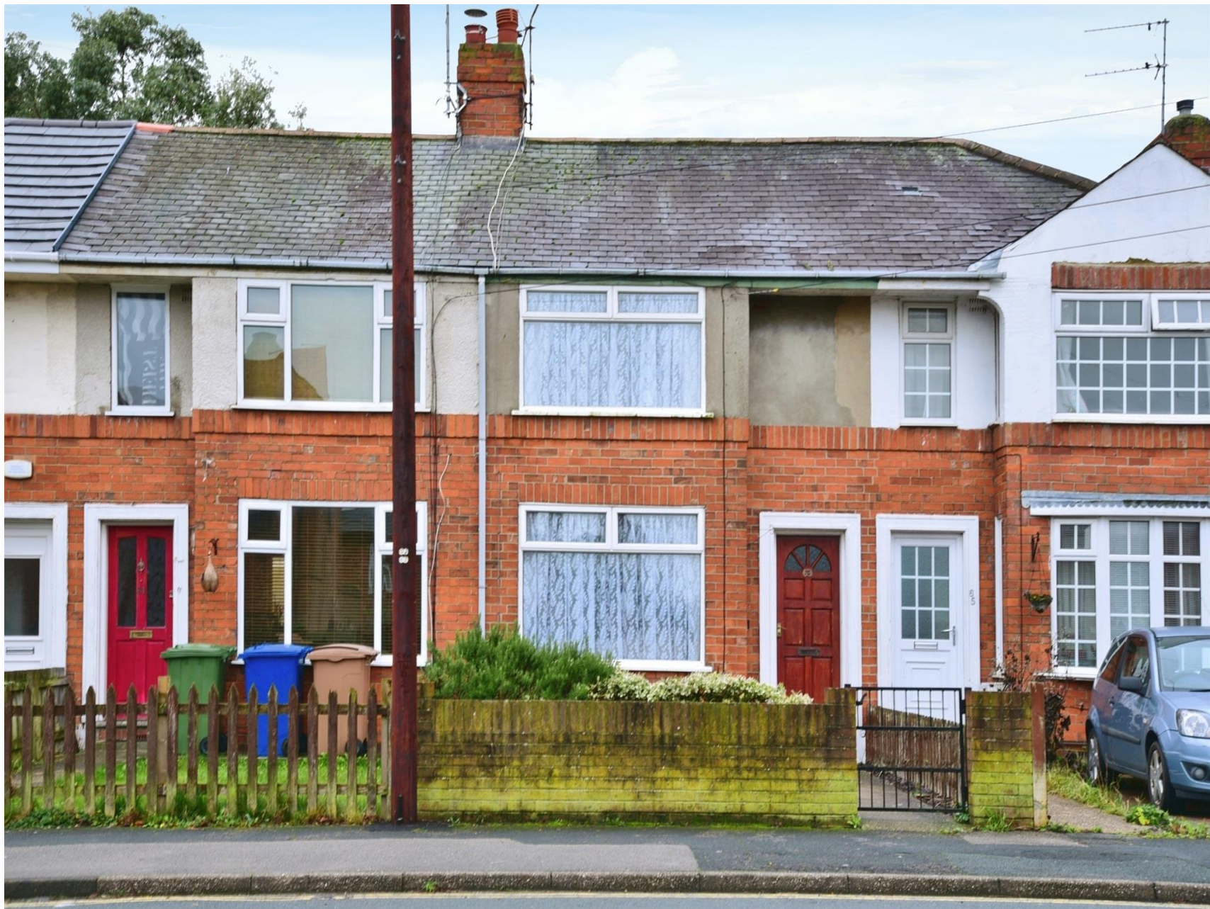
Cherry Tree Lane, Beverley, HU17 0AZ