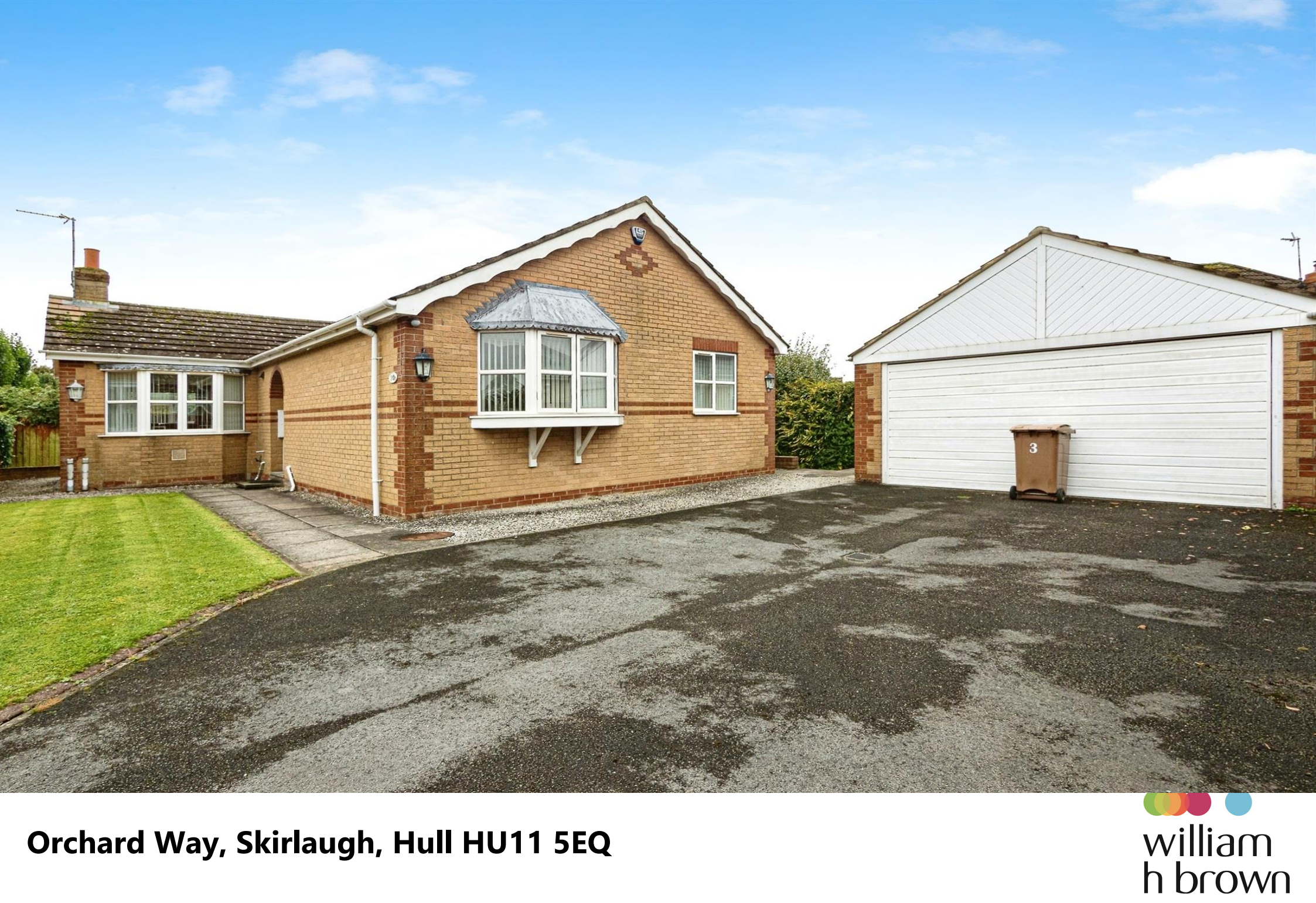
Orchard Way, Skirlaugh, Hull HU11 5EQ