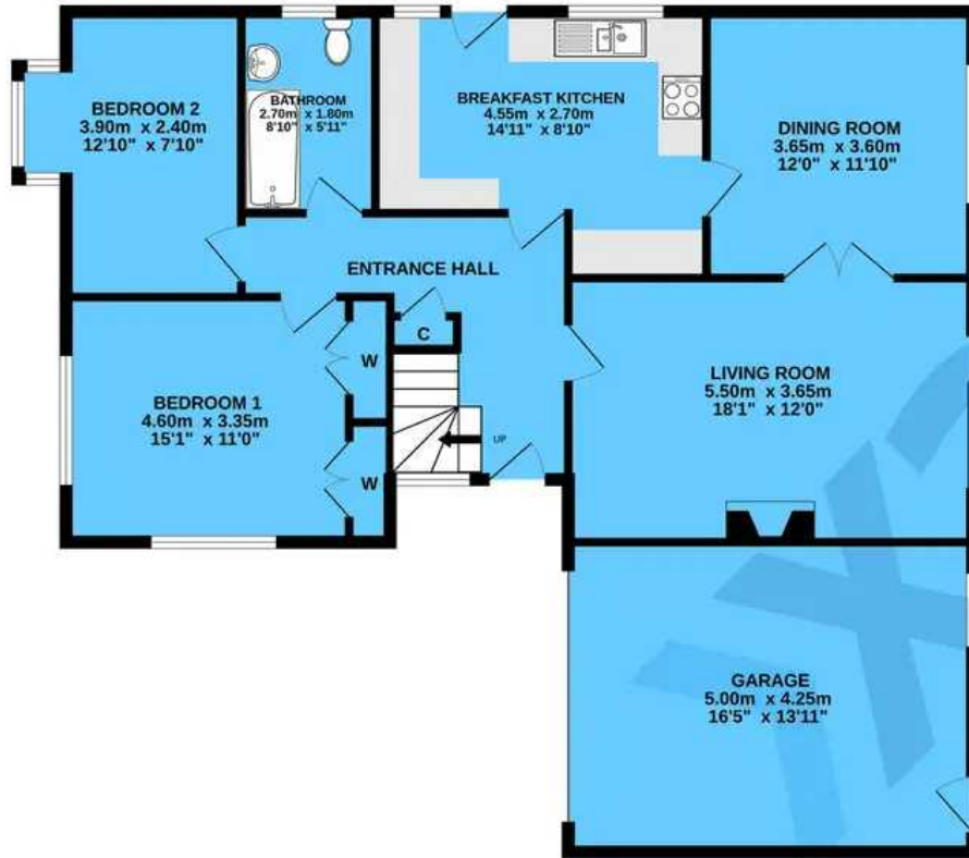
GROUND FLOOR 112.8 sq.m. (1214 sq.ft.) approx.