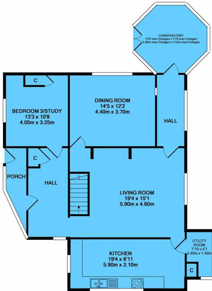
GROUND FLOOR APPROX. FLOOR AREA 1118 SQ.FT. (103.9 SQ.M.)