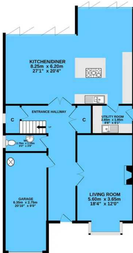
GROUND FLOOR 111.3 sq.m. (1198 sq.ft.) approx.