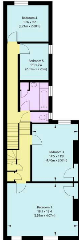
First Floor GROSS INTERNAL FLOOR AREA APPROX. 827 SQ FT / 76.84 SQ M