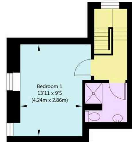
Second Floor GROSS INTERNAL FLOOR AREA APPROX. 247 SQ FT / 22.93 SQ M

NOT TO SCALE - FOR ILLUSTRATIVE PURPOSES ONLY APPROXIMATE GROSS INTERNAL FLOOR AREA 1426 SQ FT / 132.38 SQ M All measurements and fixtures including doors and windows are approximate and should be independently verified. www.exposurepropertymarketing.com © 2025