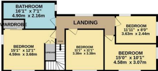
1ST FLOOR 757 sq.ft. (70.3 sq.m.) approx.