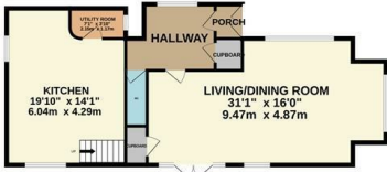
GROUND FLOOR 854 sq.ft. (79.3 sq.m.) approx.