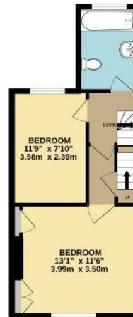
1ST FLOOR 354 sq.ft. (32.9 sq.m.) approx.