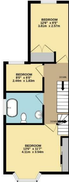
1ST FLOOR 419 sq.ft. (38.9 sq.m.) approx.