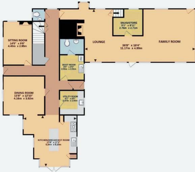
GROUND FLOOR 1752 sq.ft. (162.8 sq.m.) approx.