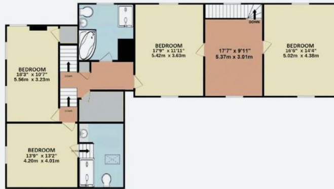
1ST FLOOR 1431 sq.ft. (133.0 sq.m.) approx.